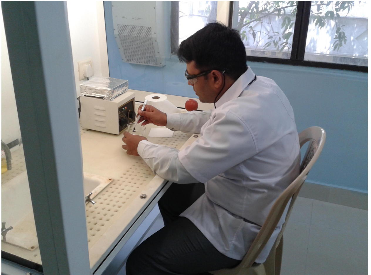
Furnace (up to 1000°C)