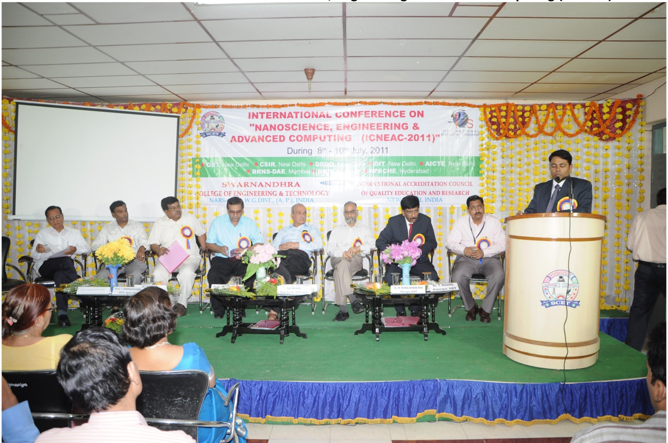
Distinguished guests on the dais.