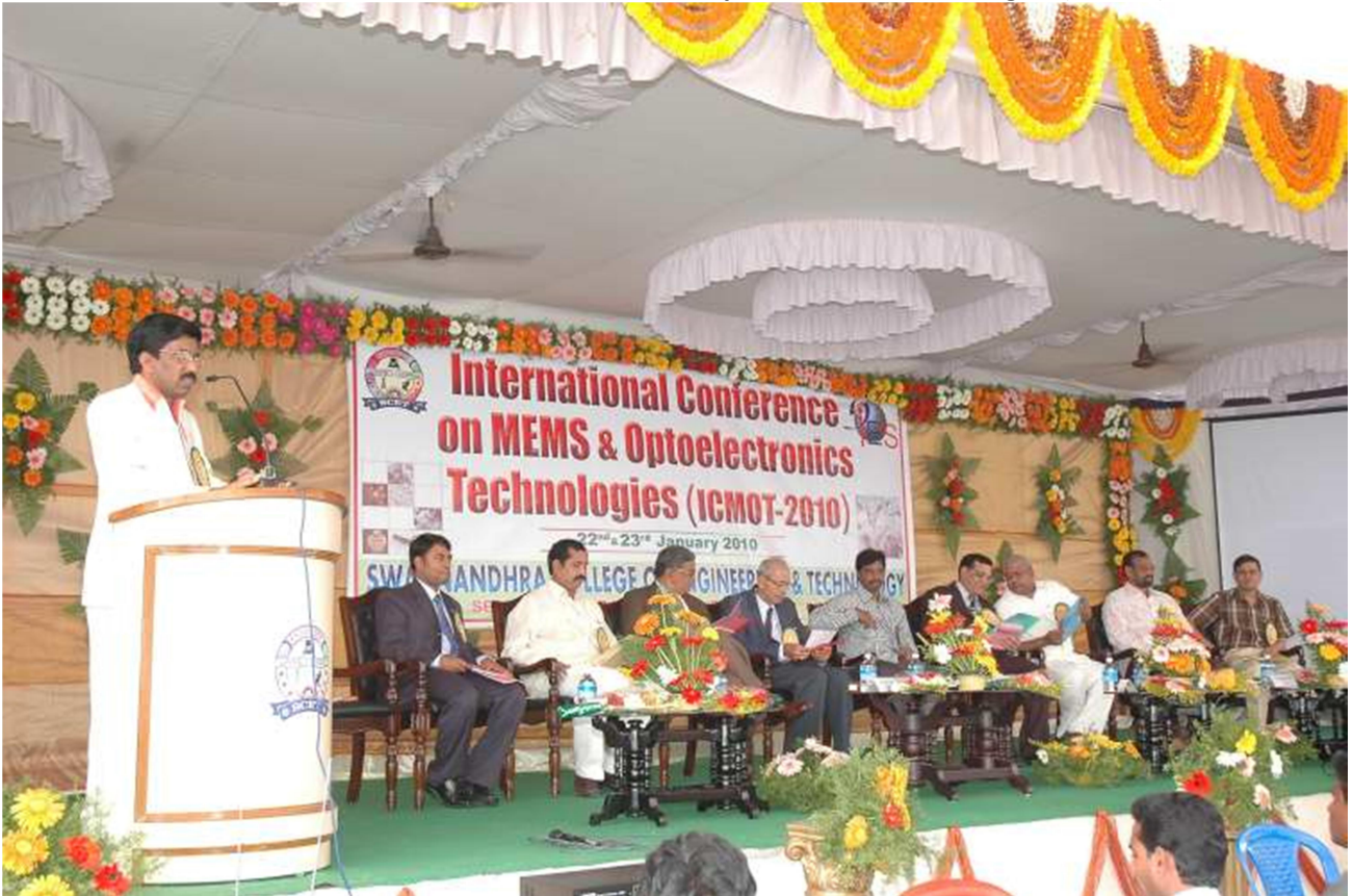
Distinguished guests on the dais.