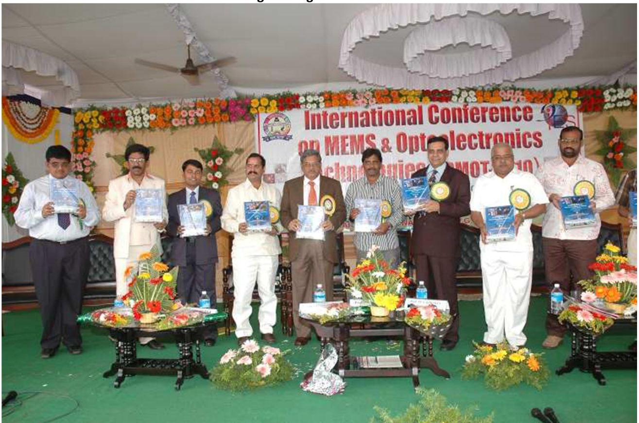
Release of Proceedings of 1 st International Conference on MEMS & Optoelectronics Technologies (ICMOT)