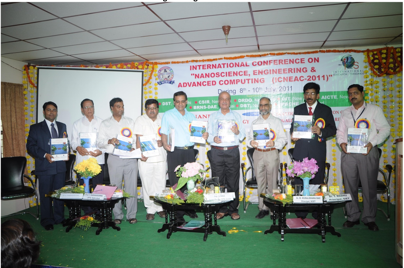
Release of Proceeding of 2 nd International Conference on Nanoscience, Engineering & Advanced Computing (ICNEAC)